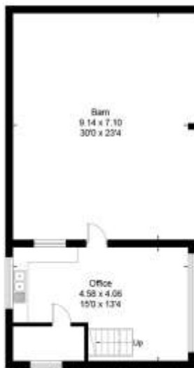
Outbuilding - Ground Floor