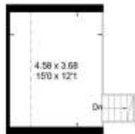
Outbuilding - Loft Space